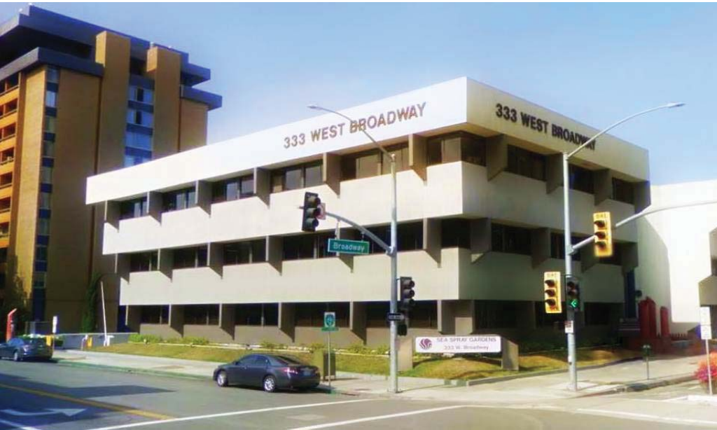
Suite 208 Layout

333 West Broadway, Suite 208 | Long Beach | California